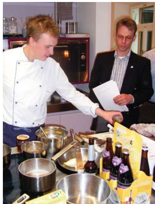
A class in the Biersommelier program emphasizes cooking with beer