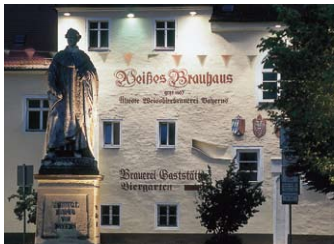
Private Weissbierbrauerei G. Schneider & Sohn in Kelheim