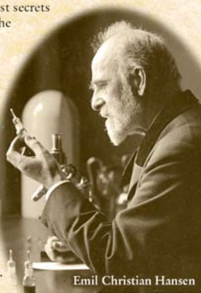
Emil Christian Hansen

But science ultimately proved Hansen correct, and his findings have been at work in breweries ever since. The groundbreaking research of Emil Christian Hansen is just one chapter in beer’s epic saga. Find them all at BeerBooks.com.