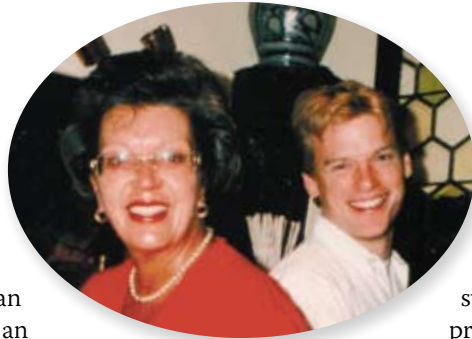
The fifth and sixth generations of the Trum family, owners of the Schlenkerla Brewery.

However, most Germans, when asked what beer they prefer, will answer, passionately, with a brand name. This is the German paradox: we love beer dearly, it is an integral part of our culture, yet it has become a commodity.