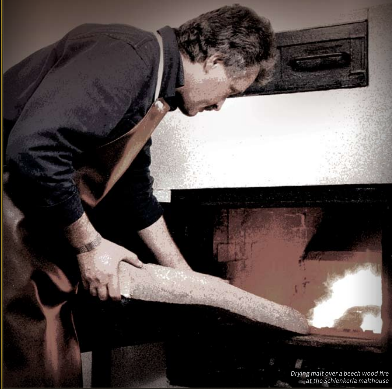
Drying malt over a beech wood fire at the Schlenkerla malthouse